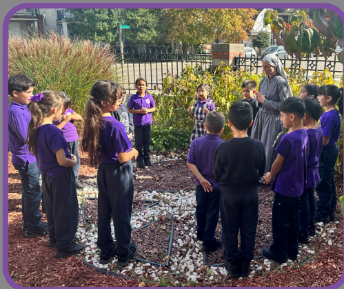
Peace Garden Prayer