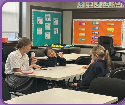
Language Arts Group

Programs are in place to meet students' academic needs through small group learning. With classroom aides, GEM Room tutors, and special programs such as coding, robotics, and medical club; we are continuously finding ways to keep our students engaged and excited about learning.