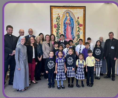
Holy Redeemer Prayer Room